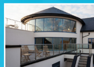
Gara Rock, East Portlandmouth - £12m

This high-quality new-build development consisted of 5 cottages, 12 apartments, a leisure pool, spa, boutique hotel and restaurant. This project was over half way into its programme when the funders decided to take control and deliver it with the expertise of a construction manager. This followed a 3 month period in which a feasibility review of the project was undertaken on behalf of the funders and principal shareholder. Prior to a CM delivery, the project had been inundated with issues and a victim of the recession, together with problematic early development decisions.