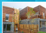
Talland Bay, Looe - £3m

118 bed student accommodation facility, made up of a number of contemporary studio flats and stylish premium en-suites in the heart of Falmouth. After a number of issues on site regarding progress and safety, Moor Manage were appointed by the client to take over and get the project back on track. The site was around 60% complete with only the sales show suite ready. Moor Manage have had to assess quality, work with design teams on remedials, and incorporate into the programme for completion.