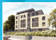
Carrick View, Falmouth - £5.85m

This high-quality new-build development consisted of 5 cottages, 12 apartments, a leisure pool, spa, boutique hotel and restaurant. This project was over half way into its programme when the funders decided to take control and deliver it with the expertise of a construction manager. This followed a 3 month period in which a feasibility review of the project was undertaken on behalf of the funders and principal shareholder. Prior to a CM delivery, the project had been inundated with issues and a victim of the recession, together with problematic early development decisions.